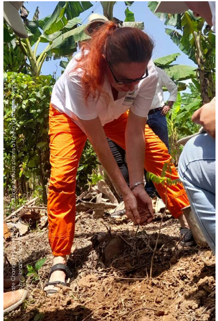
Climate Change program in the Dominican Republic