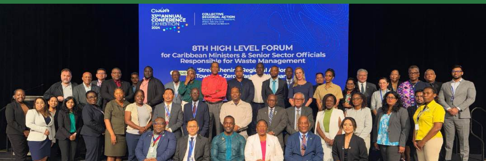
8th High-Level Forum of Caribbean Ministers Responsible for Waste Management

Their message was clear: waste isn't just a national problem - it is a Caribbean challenge that needs a united response.