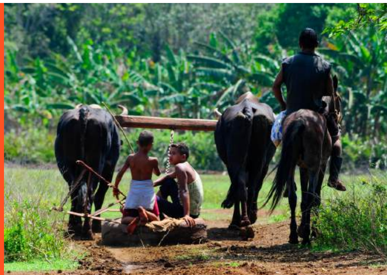
Family at Desembarco del Granma National Park (Credit: WCS)

- By Wildlife Conservation Society (WCS)