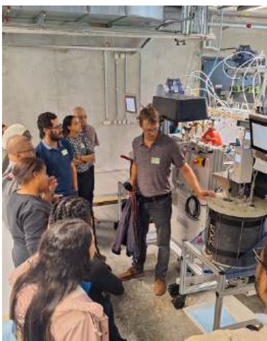
Laboratory tour in the biogas technology centre

To complement this, Caribbean researchers took part in online trainings on biomass characterisation and biogas conversion. The collaboration also extended to Germany, where DBFZ hosted two on-site trainings: a one-week intensive programme with 13 participants, and a five-week residency with 7 researchers. These exchanges allowed Caribbean scientists to gain hands-on experience, laying the groundwork for local innovation.