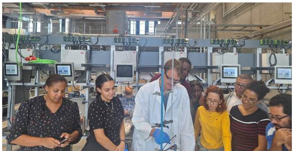
Determination of Volatile Fatty Acids-Titration