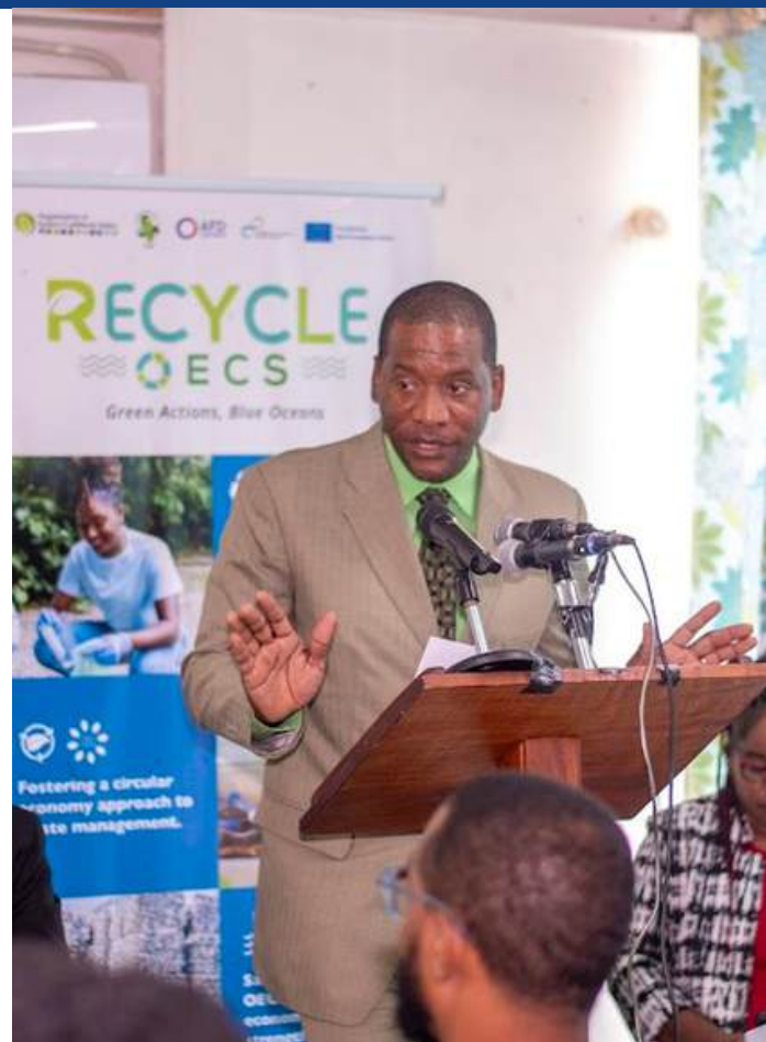
Launch and commencement of consultations in Dominica (General Manager, Dominica Waste Management Corporation)

More than that, ReMLit helped deliver tools to make a difference, from communication equipment to heavy duty waste handling machinery such as horizontal balers, all aimed at helping governments scale real solutions.