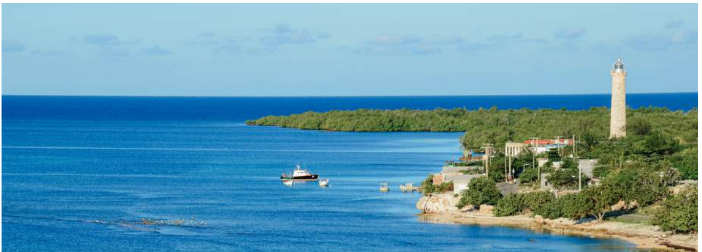
Pier at Desembarco del Granma National Park

With expertise in marine conservation, community engagement, and sustainable resource management, WCS is uniquely positioned to lead projects that bridge environmental protection with social and economic benefits. Their work in eastern Cuba builds on this legacy – demonstrating how science, policy, and people can come together to create innovative, lasting solutions for both nature and communities.