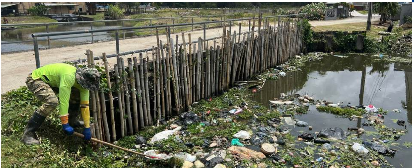
Monitoring Activity at Demo Site in Guyana

Dominican Republic: Installed a river interceptor in the Río Yaque del Norte (collecting 73 tons of waste by Dec 2024), engaged 8,614 people in clean-ups, and launched “Blue Stations” that involved 800 households, collecting 157 tons of plastic waste. This project will be continued with the support of the ACE Facility, as ISA University will expand the project in Montecristi, Santiago and Valvedere Provinces along the river.