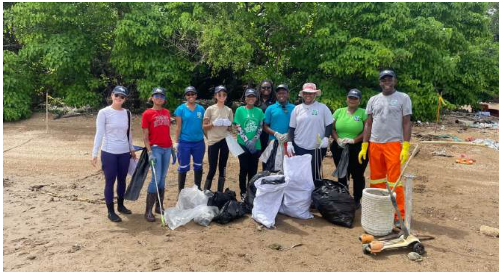
First Sampling Activity – Trinidad & Tobago (Credit: Malisa Peters)