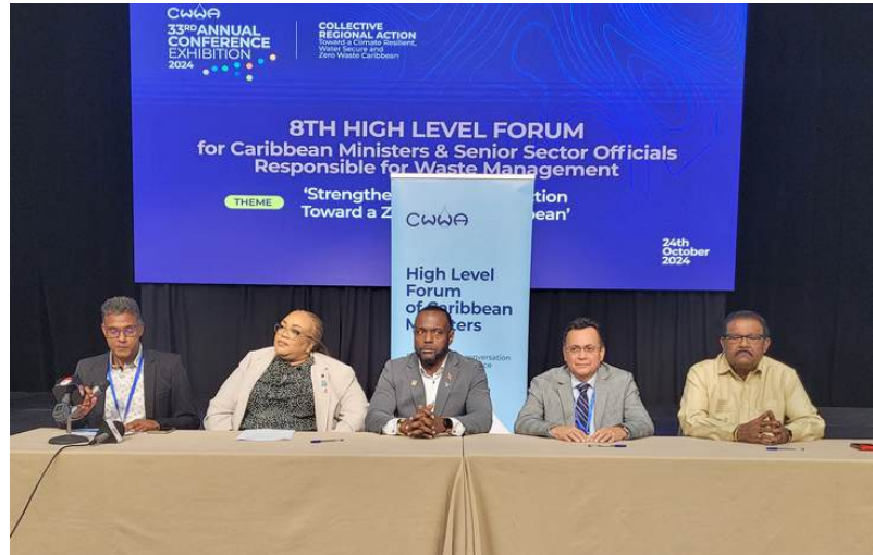
Declaration Signing