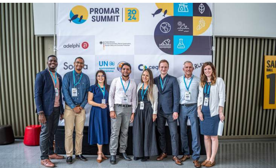
PROMAR Summit 2024