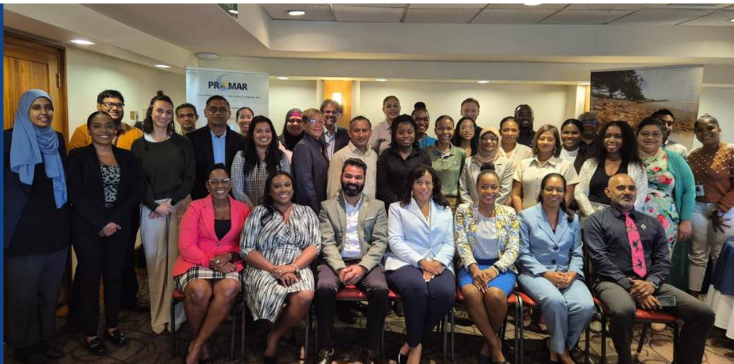
National Dialogue on Marine Litter Prevention - Trinidad & Tobago

“Marine litter isn’t just a waste issue — it’s about protecting the lifeblood of Caribbean communities.”