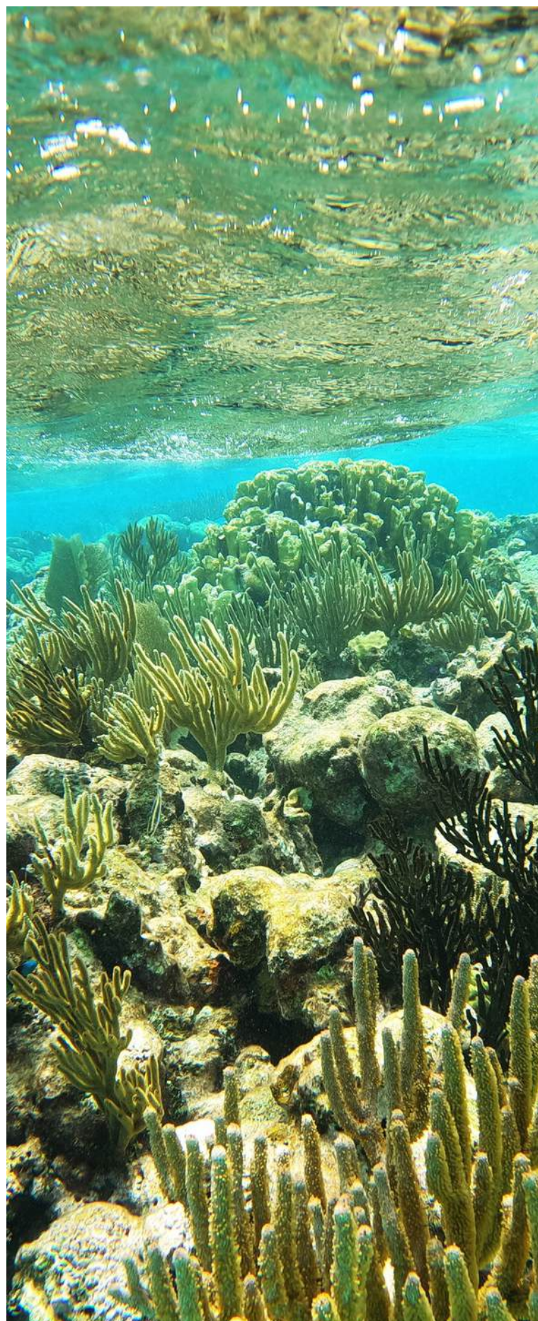
Reef at Maisi Caleta Protected Area

To tackle this issue head-on, the Wildlife Conservation Society (WCS) will launch a three-year project titled "Transforming Marine Litter to Support Local Livelihoods and Ocean Health in Coastal Protected Areas of Eastern Cuba" under the Advancing Circular Economy (ACE) Facility, funded by the Caribbean Biodiversity Fund (CBF). The initiative not only aims to clean up and prevent marine litter but also to transform it into new opportunities for sustainable livelihoods.