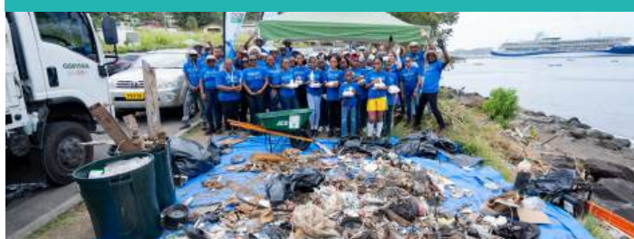
Clean up activity in Grenada to mark end of project