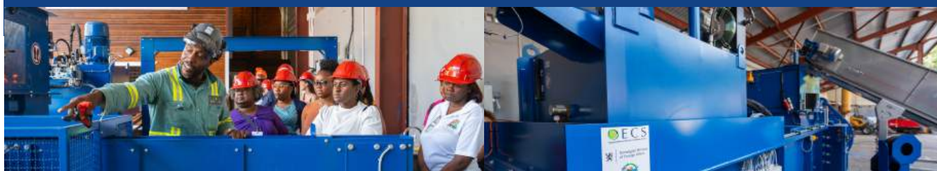
Horizontal baler provided by the ReMLit Project to serve Queen's Park Recycling Facility in Grenada